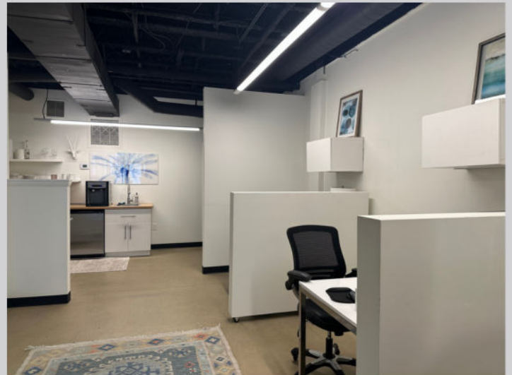
OPEN OFFICE AREA