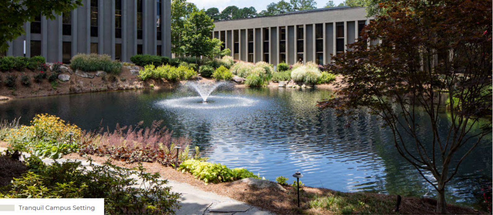
Tranquil Campus Setting